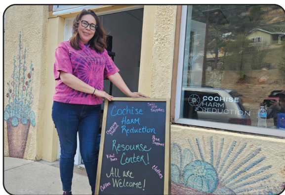
Resource Center Opened in Old Bisbee