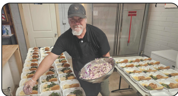
Launched CHRs Hot Meals Program