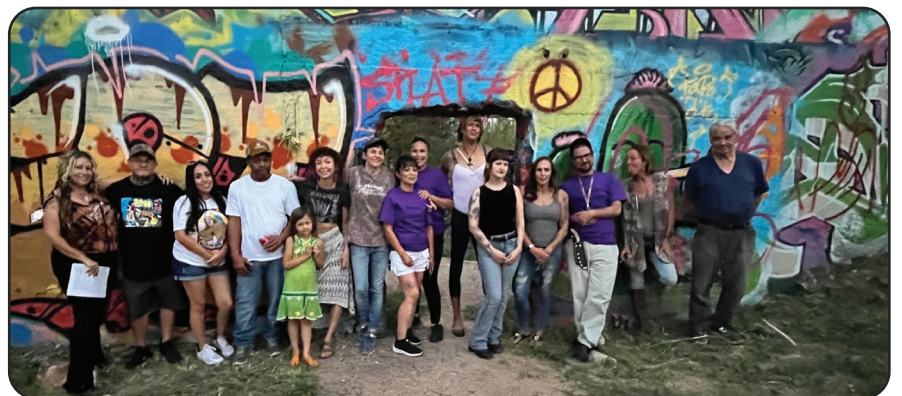
International Overdose Awareness Day in Bisbee hosted by CHR Team