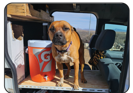
Enjoyed Time with Our Friends