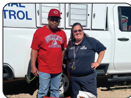
Strengthened Partnerships with Community