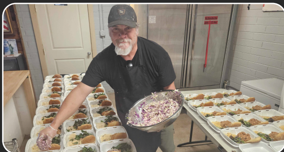
Launched CHRs Hot Meals Program