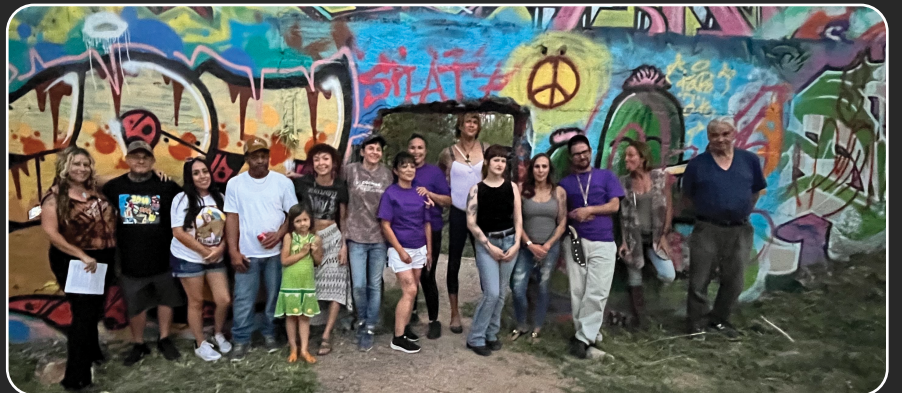
International Overdose Awareness Day in Bisbee hosted by CHR Team