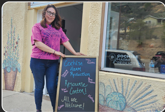
Resource Center Opened in Old Bisbee