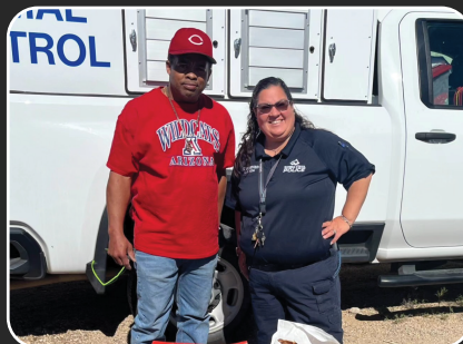
Strengthened Partnerships with Community