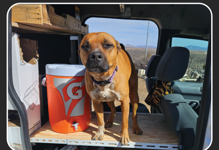
Enjoyed Time with Our Friends