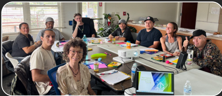
PRSS Training + Certifications