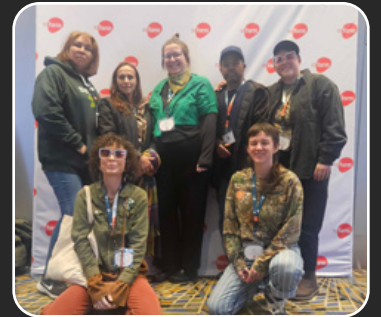
DPA in Detroit