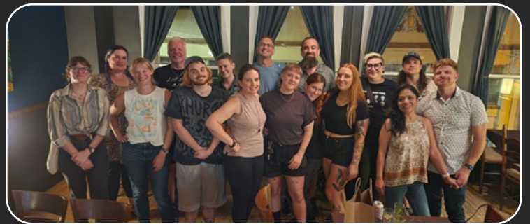
1st Annual AZ Harm Reduction Coalition Convening