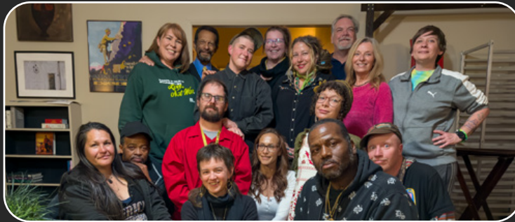
CHR Holiday Party 2025